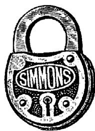
2 1/8 INCHES

SIMMONS (12) OFFERED: 1921 thru 1929. Not listed in the 1930 catalogue WIDTH: 1 11/16 inches 2 inches MATERIAL: Wrought steel Top and bottom are bronze Steel shackle